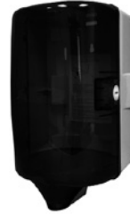
#9123 SMALL CENTER-PULL DISPENSER - Adjustable tension minimizes roping and maximizes perfwing with different towel types - Fits (250-ct.) #1566 and (525-ct.) #1448, #1574 QUICK WIPES - Durable, smoky black plastic - Lock prevents tampering