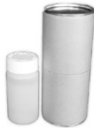
#9120 WATER TREATMENT SAMPLE KIT - For submitting samples of boiler and cooling water