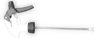
#9115 TRIGGER SPRAYER - PINTS - Fits pint bottles - Chemical resistant