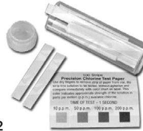
#9122 CHLORINE TEST STRIPS - For testing solutions of #778 SC SANITIZING RINSE