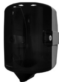
#9125 LARGE CENTER-PULL DISPENSER - Adjustable tension minimizes roping and maximizes perfwing with different towel types - Fits (400-ct.) #1539, (900-ct.) #1567, #1574 FACILITY WIPES - Durable, smoky black plastic - Lock prevents tampering