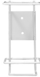
#9112 TOWEL CANISTER HOLDER - Wire, wall-mount, holds 81mm canisters - Ideal for #1448, #1500, #1541, #1565