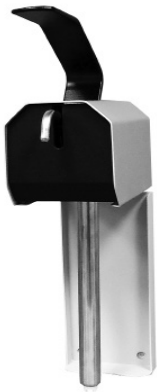
#9110 WATERLESS HAND CLEANER DISPENSER - Wall mount - Holds 1-gallon flat top containers