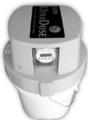
#9154 PAIL PUMP DISPENSER - Battery operated timer - Fits 5-gallon pails