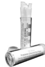
#9124 IODINE TEST STRIPS - For testing solutions of #770 RICHCO BOCK SANITIZING RINSE