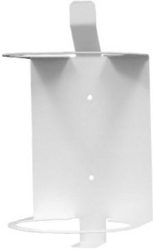
#9105 METAL TOWEL CANISTER HOLDER-MEDIUM - Metal, wall-mount, holds 100mm canisters - Ideal for (40-ct.) #1447, #1545, #1546, #1549, #1558