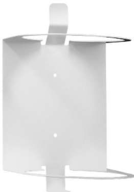
#9111 METAL TOWEL CANISTER HOLDER-LARGE - Metal, wall-mount, holds 120mm canisters - Ideal for (70-ct.) #1539, (100-ct.) #1566, (180-ct.) #1567, (180-ct.) #1568, #1574 CART WIPES, #1616